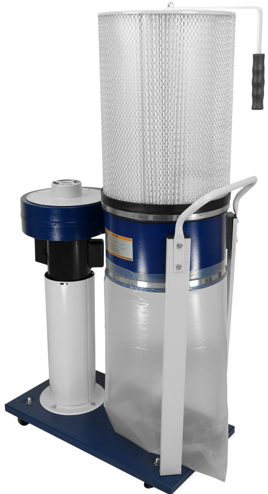
Shown with Dust Canister 60-900

1 HP Bag Set (Sets Include 1 Cloth Bag and 1 Clear Plastic Bag)